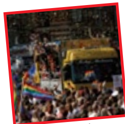
Cph Pride parade

For a complete list of participants in the parade, a detailed map of the route and the programme at Frederiksberg Town Hall, please visit copenhagenpride.dk .