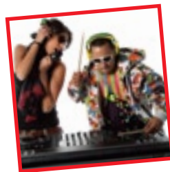
DJs Deaf Twins