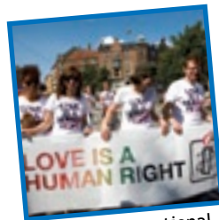
Amnesty International @ Copenhagen Pride Parade

11:00 pm Check out the parties in the city. E.g. Lewd@K3, World Outgames #1@Zum Biergarten or 80-90ies party @ Be Proud - info at copenhagenpride.dk